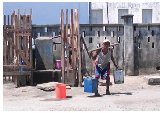
Figure 2. Carrying water on a yoke. Tanambao 2, Toamasina. Miakatra, 2008

collective water points, but in insufficient numbers (3). The distribution networks were gradually extended, but were outpaced by urban expansion and population growth. The supply rates of the two cities remain unequal: 76% for Antananarivo, 47% for Toamasina. Households use various sources of water, sometimes even in combination. Home connections are still limited to a minority of households: 24% in Antananarivo and 21% in Toamasina. Those without connections get water from standpipes supplied by the network: 900 in Antananarivo and 171 in Toamasina. In the districts outside the network, a non-negligible proportion of the population use individual wells. Collecting water is an arduous activity. The distance from home to water point ranges from 5 meters to 200 meters and beyond. When the water pressure is low, it can be a long wait. And the carrying of water recipients, on the head or across the shoulders, is a daily chore for the men, women and children in deprived areas.