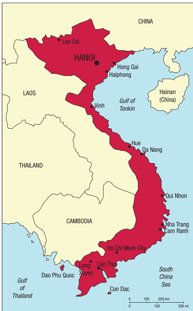
Figure 1. Location of Hanoi

The city is one of the oldest capitals in South East Asia, and in 2010 will celebrate its 1000 th year of existence. Its rich, and at times turbulent, history has seen a number of different ruling dynasties and much conflict (Boudarel and Ky, 2002). Hanoi was under Chinese rule from the 1 st century BC through to the 10 th century AD, followed by approximately eight centuries of Vietnamese rule, which ended in 1874 when the French captured the city. When the French were defeated in 1954, Hanoi returned to Vietnamese rule, but self-rule was again threatened during the American War, which was waged from 1954 until the Americans were finally defeated in 1975.