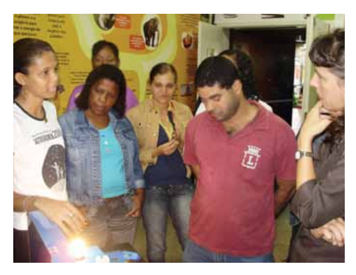
Figure 2. Teachers on the capacity building course interacting with the "Energy Consumption" module.

Although nowadays science is discussed in the media, we should be careful with information conveyed though these