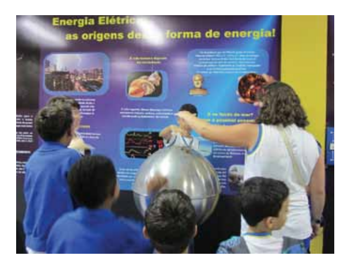
Figure 1. "Energy and Life" exhibition