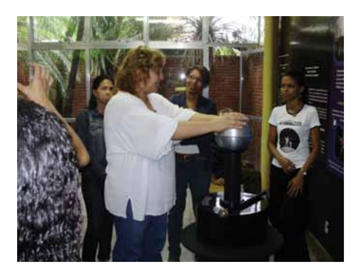
Figure 3. Teachers in the mini-course interacting with the "Electricity and Magnetism" module.

program for teachers at the ECI. We thus stimulated teachers to reflect on the themes in question, and involved them in the process of setting up a science exhibition.