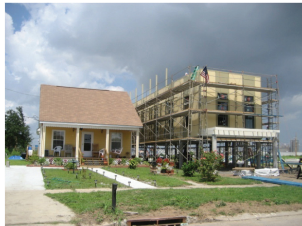
Figure 5: The Make It Right project's pink houses.

Figure 6: The Make It Right project in the works.