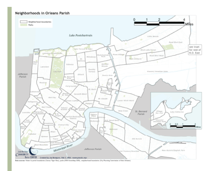
Figure 3: The Neighborhoods of Orleans Parish.

The Lower Ninth Ward's territorial vulnerabilities were exacerbated by some infrastrucutral and planning choices. The area was chosen as the site for construction of the Industrial Canal from 1918-1923. The canal, which runs for 5.5 miles through the Lower Ninth Ward, only reinforces its geographic detachment from the rest of New Orleans - as did the pre-Katrina construction of the I-10 Twin Span Bridge and the significant reduction of public transportation. Finally, socio-economic vulnerability has also characterized the Lower Ninth Ward from the early 1900s, when poor settlers were forced to move to "flood-prone backswamps" (ibid.: 839). While a relative degree of racial harmony (Landphair, 2007: 839) existed earlier on in the 1900s, this harmony quickly dissipated during the fights for public school desegregation, where from 1960 to 1970, the Ninth Ward lost 77% of its white population (Landphair, 1999: 29). What is more, by 1970, 28% lived below the poverty line (ibid.).