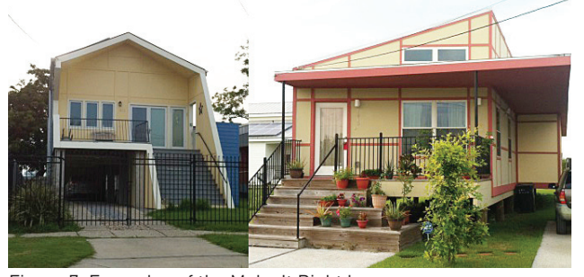
Figure 7. Examples of the Make It Right houses.